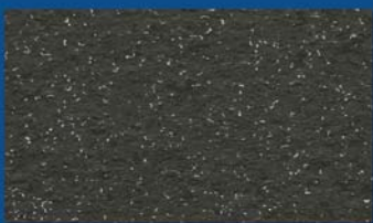
Gray White ZT-20-TS02