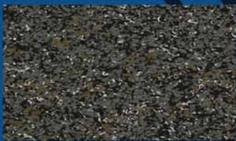
Gray Black ZT-20-TS01